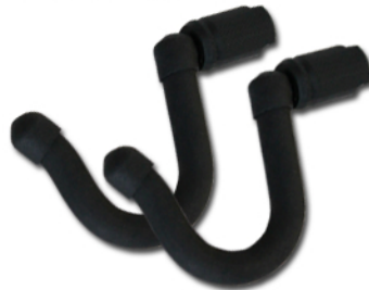
HD49: Horizontal Firearm Cradles

Combine the HDTK and HD49 (both sold in pairs) to create the HDTK system shown above in FIGURE 1 .